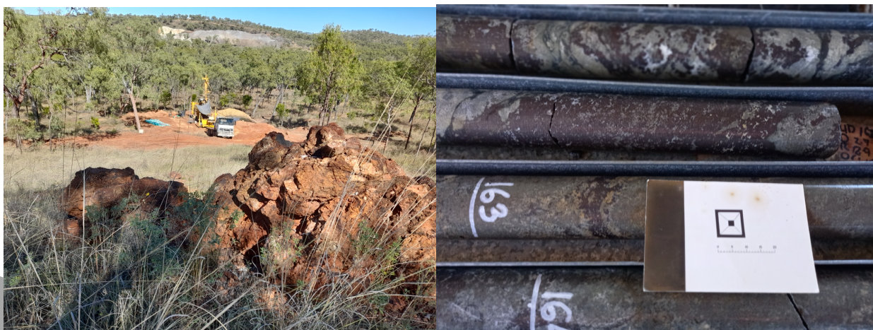
Figure 3. 3(a) Drill rig on site with Queen Grade surface gossan in foreground and King Vol zinc mine in distance. 3 (b) Massive sulphide dominated by sphalerite (zinc sulphide) (red-brown), pyrrhotite (brass colour) and calcite (white).