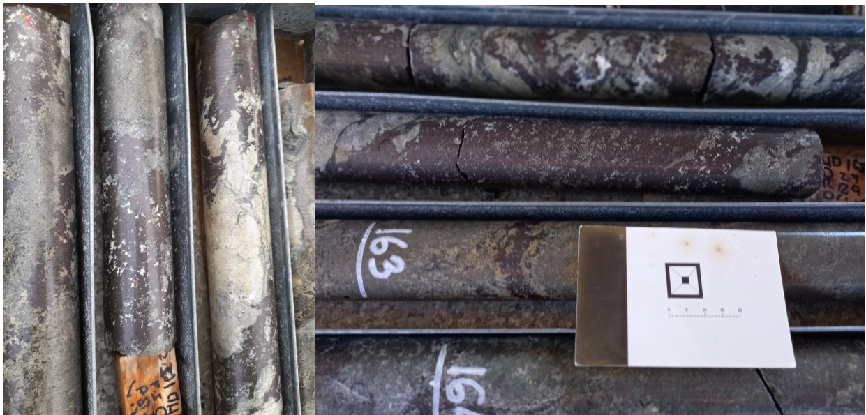
Figure 1. Massive sulphide dominated by sphalerite (zinc sulphide) (red-brown), pyrrhotite (brass colour) and calcite (white).

The intersection from 160.7 metres downhole depth comprises approximately 6 metres of massive sulphide dominated by sphalerite (zinc sulphide) followed by a further 6 metres of semi massive and banded sulphide which is also dominated by sphalerite. True width is approximately 9.0 metres.