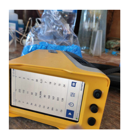
Above: Copper Sulphate assayed by portable-XRF machine

R3D also confirms that its 100% offtake agreement with Kanins International remains afoot (ASX Ann: 2 November 2022), with this initial product to be sent to Kanins shortly.