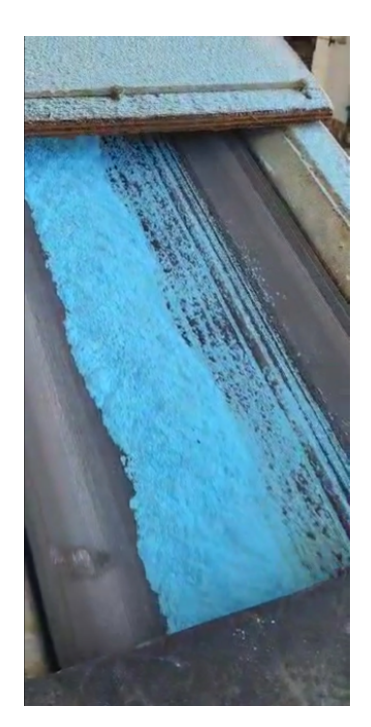
Above: Copper Sulphate on conveyor from centrifuge