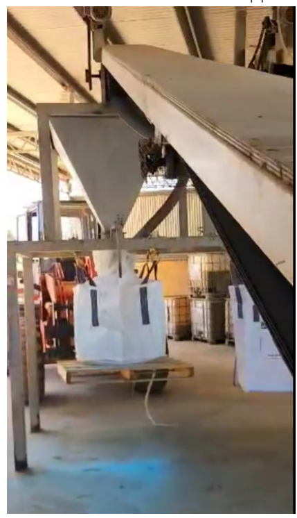
Above: Copper Sulphate going to hopper