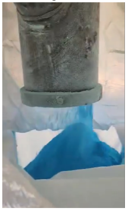
Above: Loading Copper Sulphate into bag ready for sale