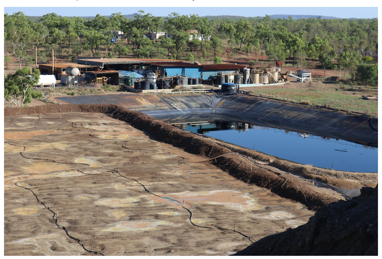
Above:. Aerial view of the Tartana Plant

R3D also confirms that its 100% offtake agreement with Kanins International remains afoot (ASX Ann: 2 November 2022), with this initial product to be sent to Kanins shortly.