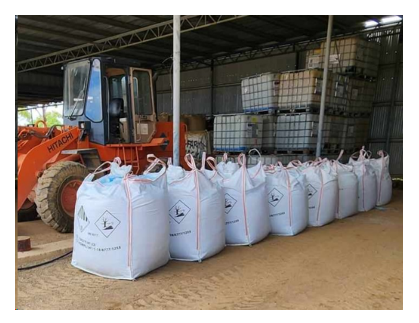
Figure 1. Copper Sulphate Pentahydrate ready for shipment.