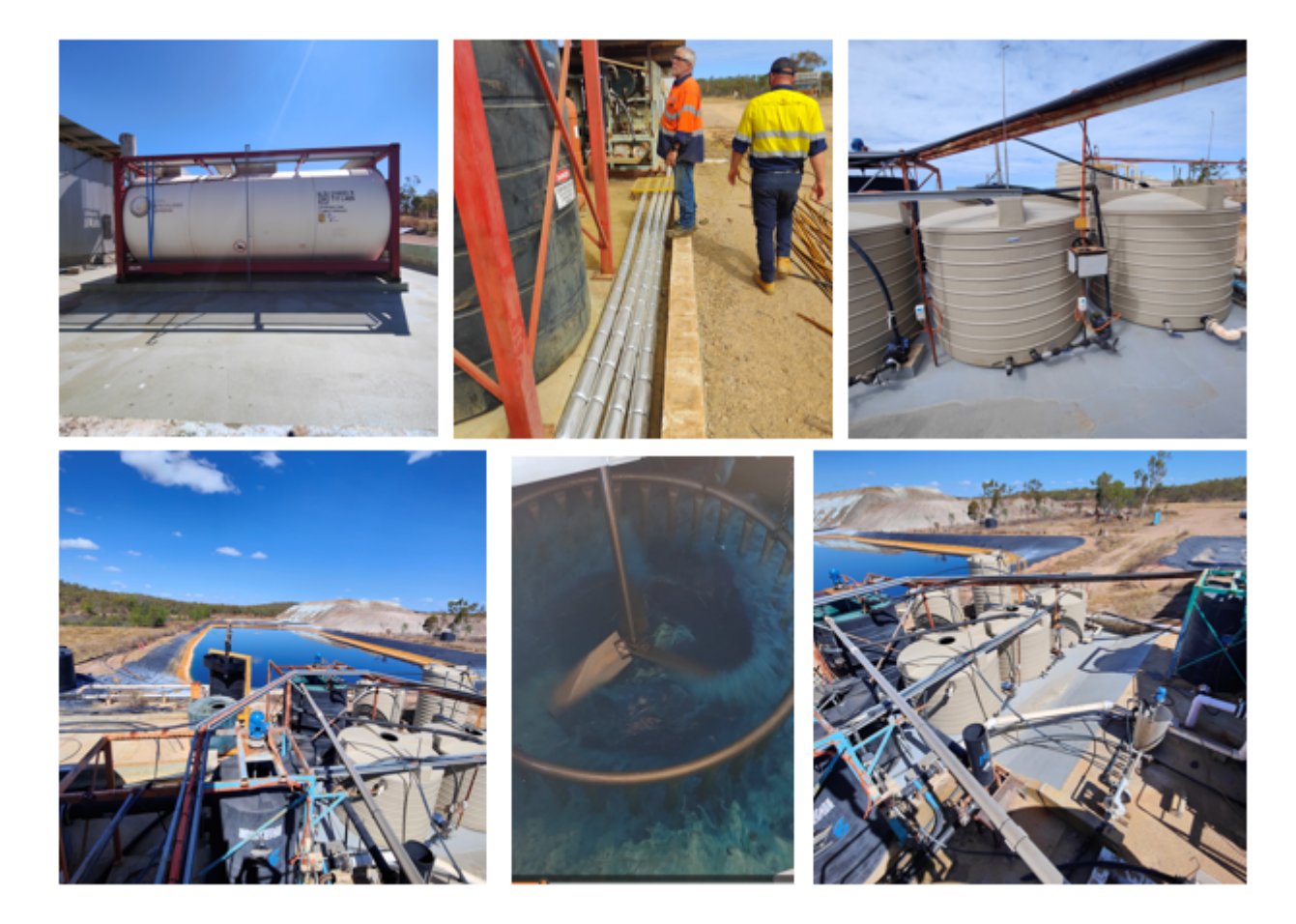
Figure 3. Tartana Solvent Extraction – Crystallisation Plant. Clockwise – New acid tanks with delivered acid, Inspection of pipework, New tanks for copper stripping, View of plant tanks and pipework, Copper sulphate crystals in crystalliser, Plant, PLS pond and heaps for leaching in distance.

Key items of the plant are depicted in Figure 4 below.