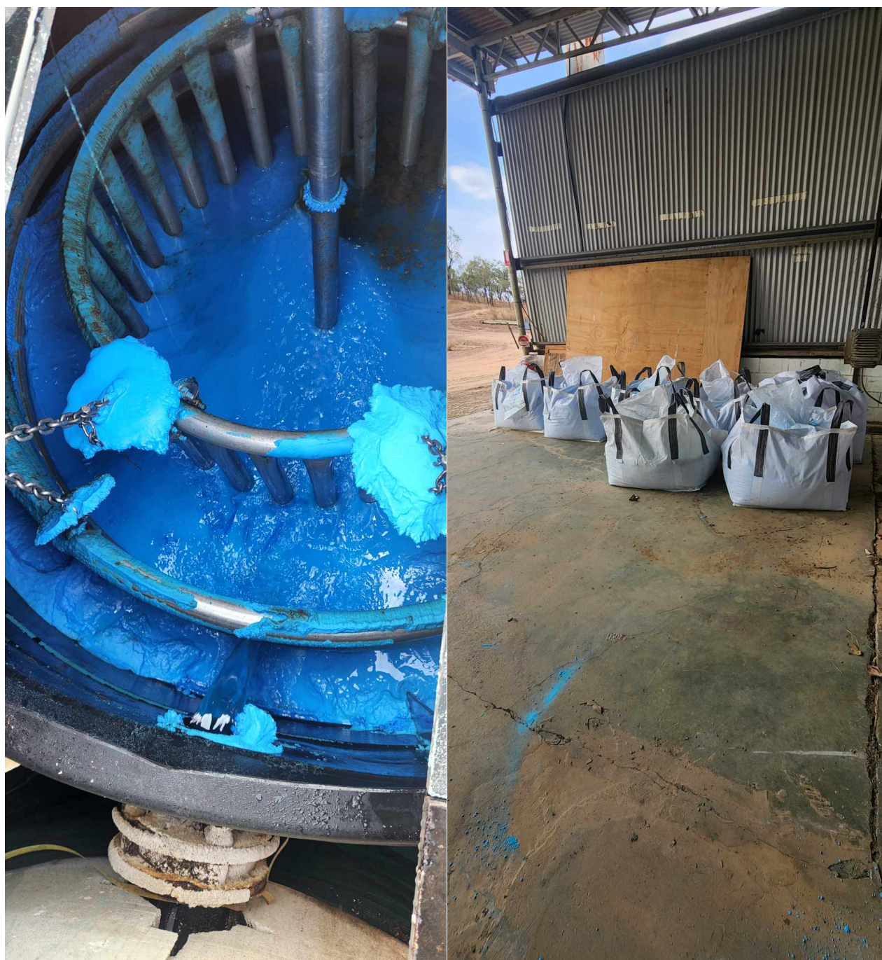
Figure 1. 1(a) Copper Sulphate precipitating in one of the chillers. 1(b) Bags of Copper Sulphate.

Kanins, our 100% offtake partner, is the market leader in Copper Sulphate sales in Australia. Kanins will be conducting a site visit in November to, amongst other things, assess our product quality and propose pricing terms for our initial production. Relying on their significant experience, Kanins will also be supporting a process improvement review as we look towards ramping production to 8+ tonnes of Copper Sulphate per day in the coming months. Additionally, the first of two new process technicians have been hired to support Copper Sulphate production.